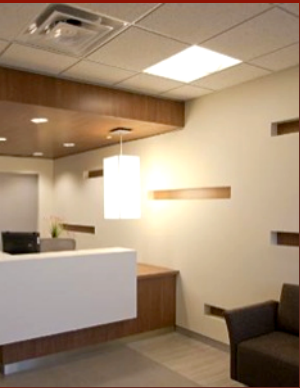
Figure to the left: Banner Health Home project | 2010

We provide interior design services from sample boards with materials and finishes schemes to complete construction documents.