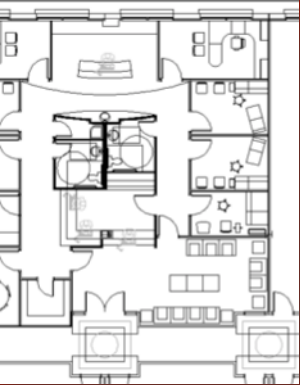
Figure to the left: Space Planning for Ensemble Devman

According to the client needs and requests, we offer solutions based on functionality, flow patterns, accessibility and quality of space.